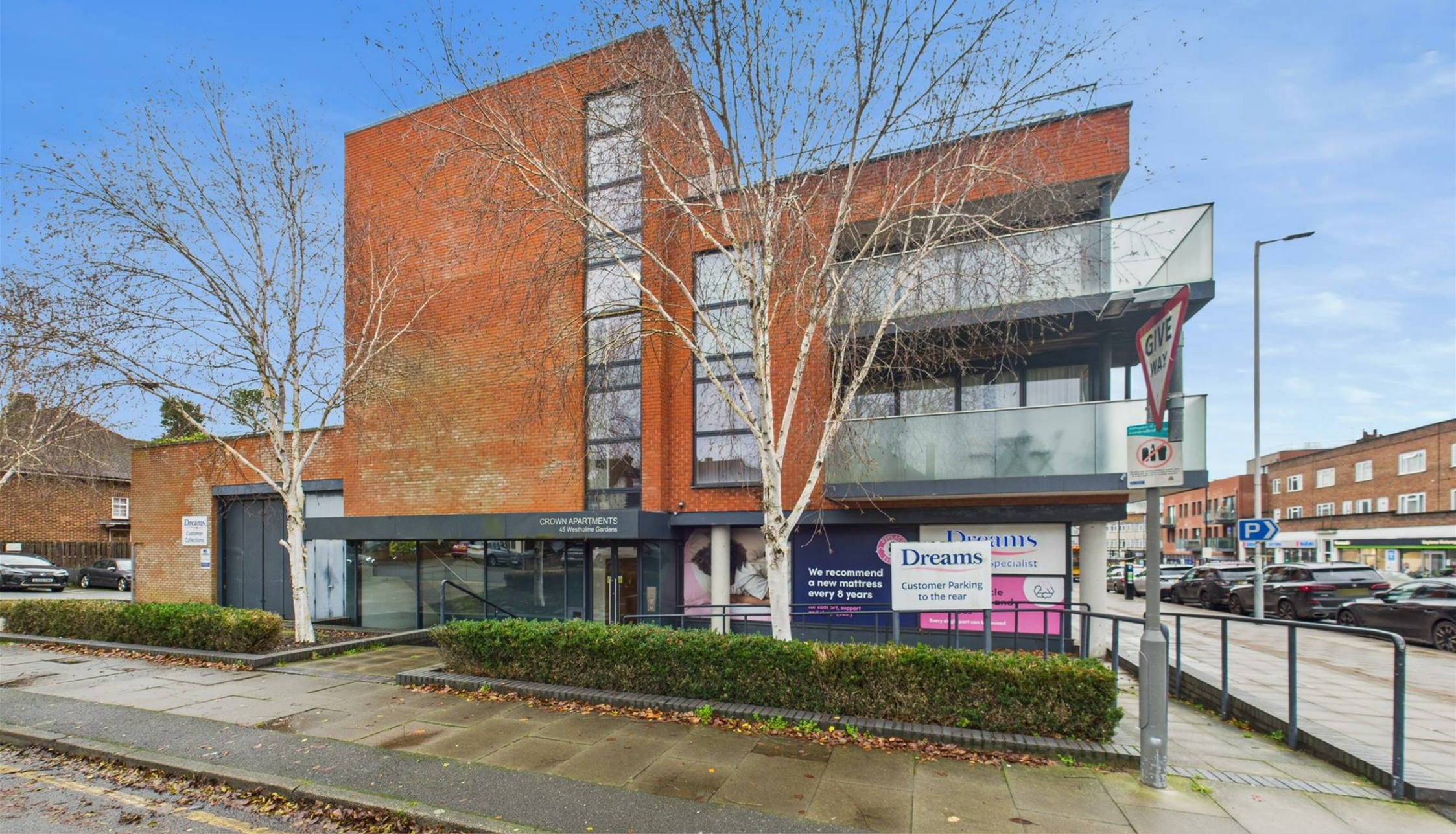
Crown Apartments, Ruislip, HA4 8QH